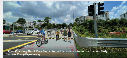
Choa Chu Kang North Park Connector will be widened to improve connectivity across Kranji Expressway.