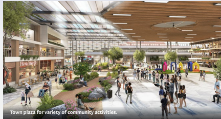
Town plaza for variety of community activities.