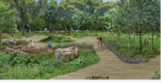
New nature play garden for experiential learning and multi-sensory experiences amidst a natural environment.