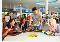
New hawker centre providing affordable food options.