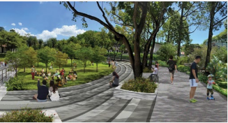
The existing multi-purpose lawn will be rejuvenated with enhanced landscaping.