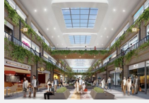
Pedestrian mall with retail and dining options, lined with greenery.